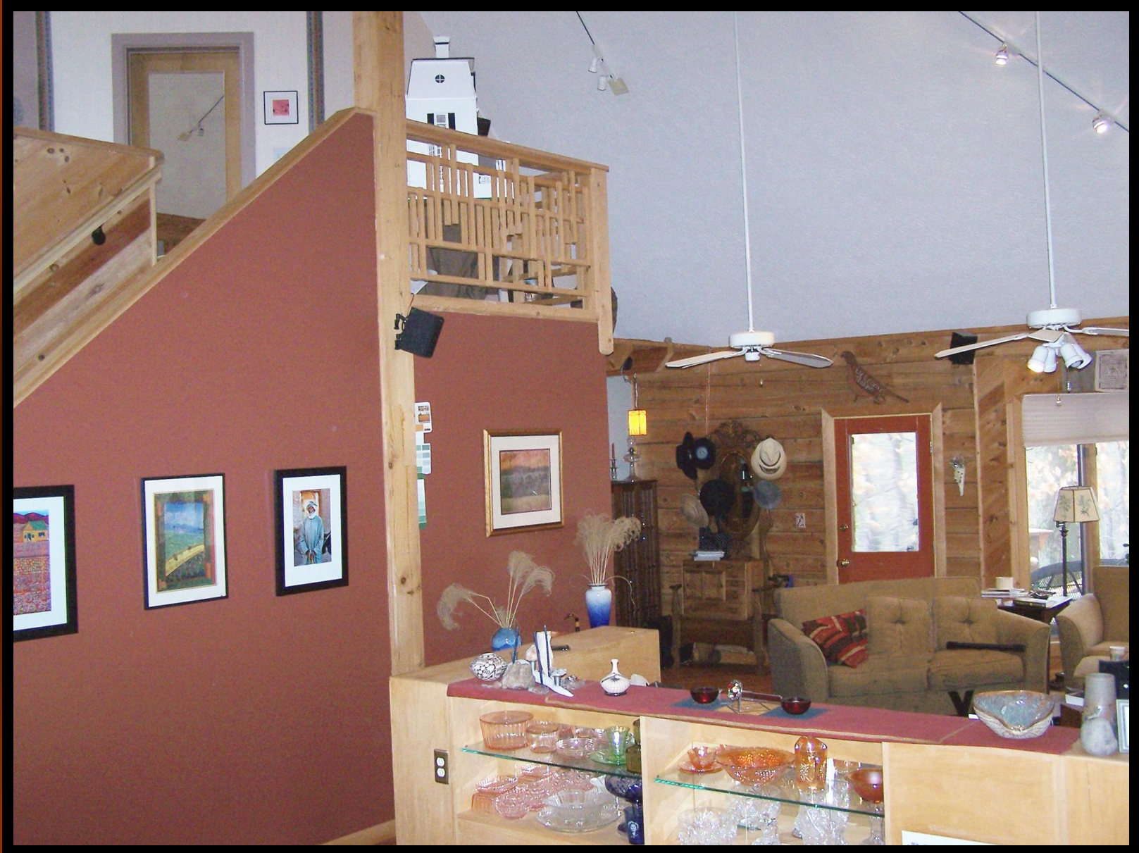
Railing and side view of stairs leading to loft.