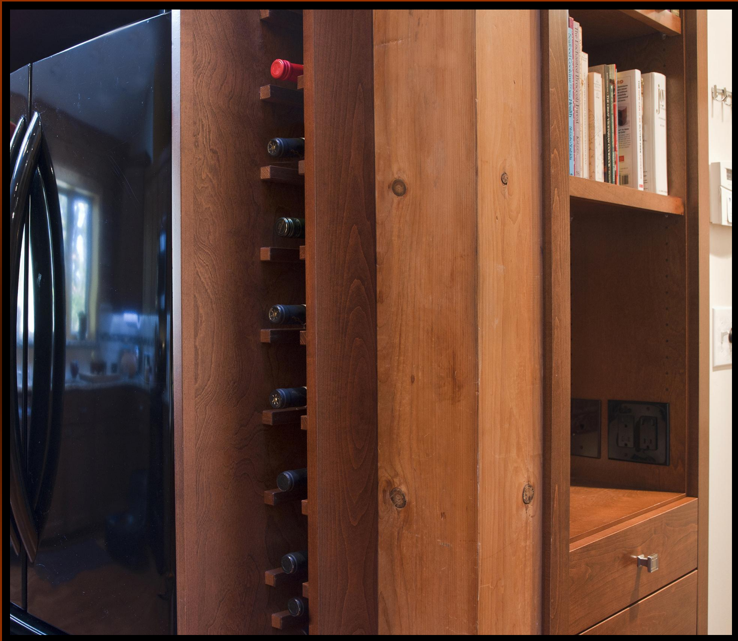
Custom wine rack was installed to right of refrigerator.